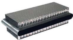
Single-Row Condenser tubes (SRC®)

The heat exchanger's finned tube, which is the core technology of the air cooled condenser, is the Single-Row Condenser (SRC®) tube. This is an elongated aluminium clad carbon steel flat tube with brazed aluminium fins.